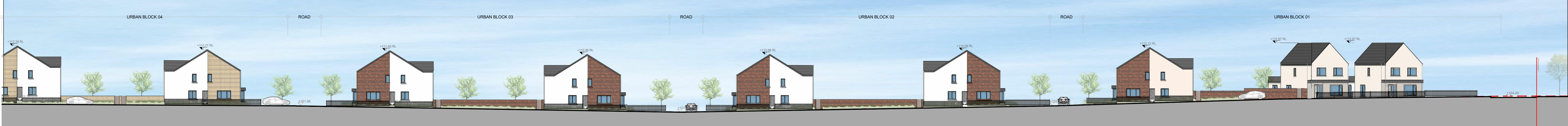
4 PROPOSED SITE SECTION 7-7 3/3