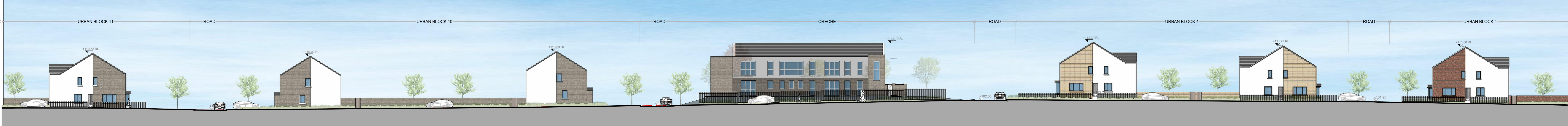
3 PROPOSED SITE SECTION 7-7 2/3