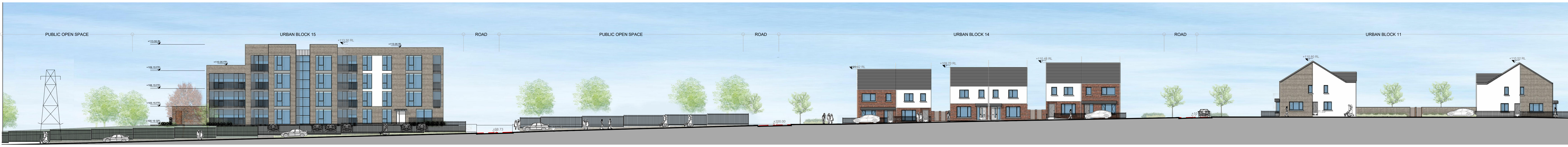
2 PROPOSED SITE SECTION 7-7 1/3